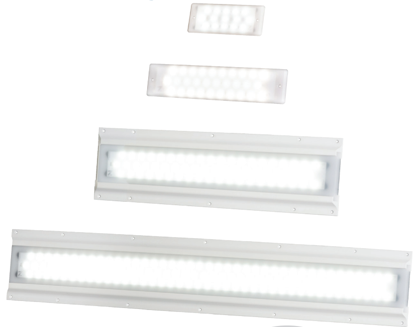
IS Series Waterproof LED Utility Lights