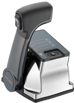
Control Head (single with PTT SW)