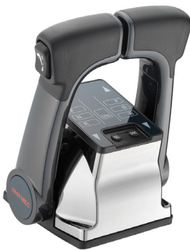
Control Head (dual with PTT SW)