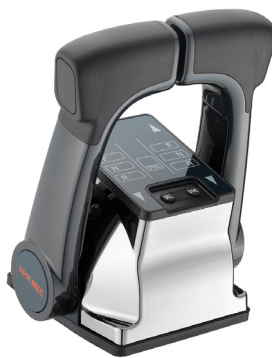
Control Head (dual without PTT SW)