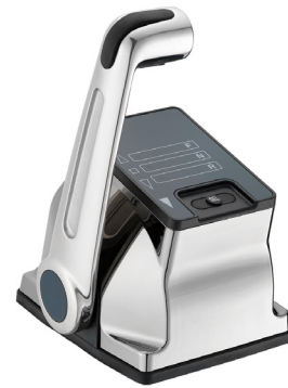
Control Head (single, stainless steel lever)