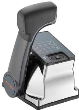
Control Head (single without PTT SW)