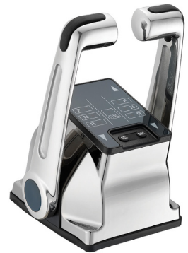
Control Head (dual, stainless steel levers)