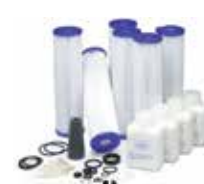
Extended Cruise Kit

Katadyn reserves the right to modify products